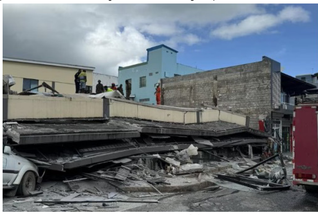
Source: The Billabong building had customers inside when the earthquake struck.” (Source: Vanuatu Broadcasting and Television Corporation ) - Vanuatu earthquake recovery effort

The PRIF team supported The Government of Vanuatu to prepare a draft Ministerial Order for an Interim Amendment to the National Building Code for Vanuatu 2000 to address earthquake loads, wind loads and the prevention and control of asbestos in construction to facilitate clear requirements the early stage building reconstruction. This draft interim amendment provided a necessary immediate response in the absence of the final draft of the revised Vanuatu NBC which is not due to be completed until May 2025 in cooperation with the Vanuatu Building Code Technical Working Group.