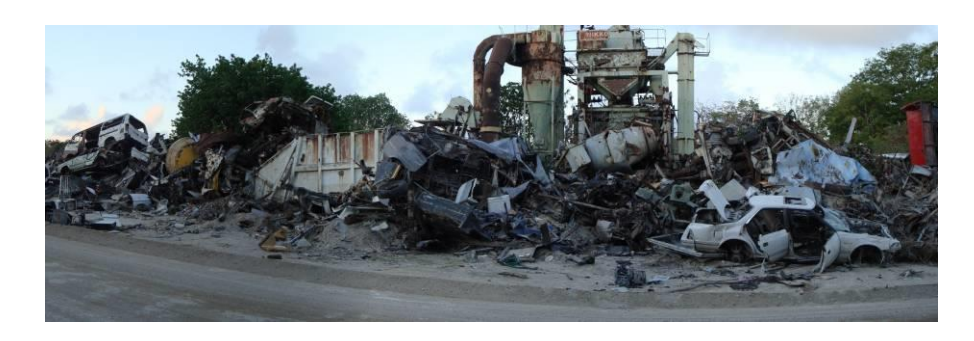
Analysis: The current dumpsite has some good basic infrastructure such as perimeter fence, and segregation bays, however the operation of the dumpsite could be improved inexpensively to be more sanitary. The segregation of bulky waste is a positive action, however further action needs to be taken to recycle this waste and also other bulky waste abandoned throughout the island.